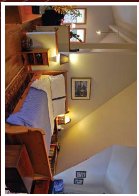
Royston House CARRIAGE HOUSE SUITE | BED & BREAKFAST